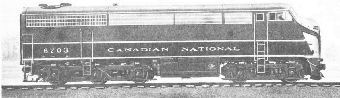
This Diesel-Electric Passenger locomotive (A unit) (Class CPA-16 — Road Numbers 6700-6705) was built for Canadian National Railways by the Canadian Locomotive Company in 1955.