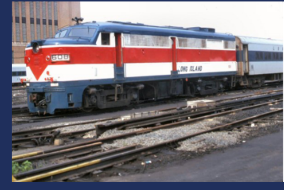
LIRR #608 (ex-Western Maryland FA-2 #304)