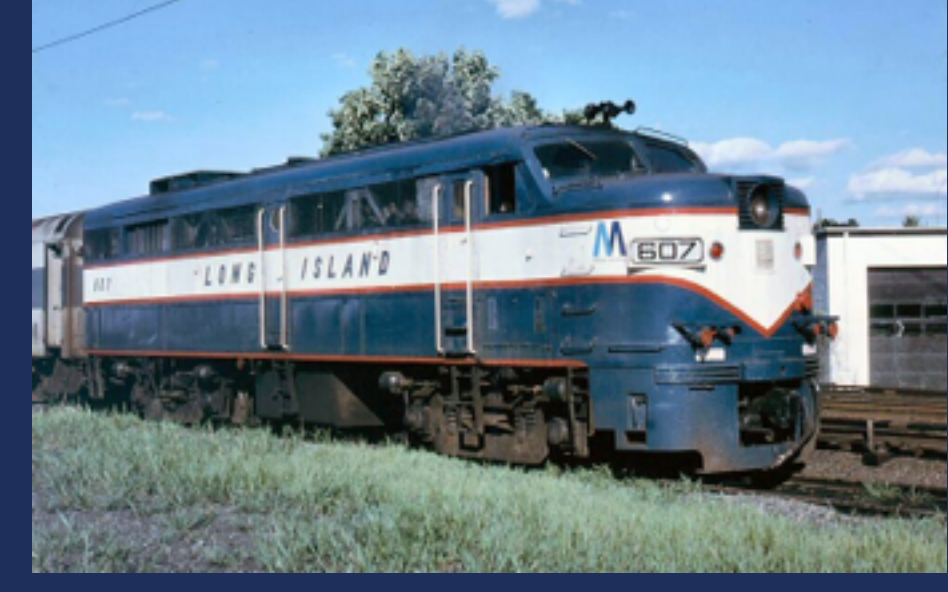
LIRR #607 (ex-Western Maryland FA-2 #303)